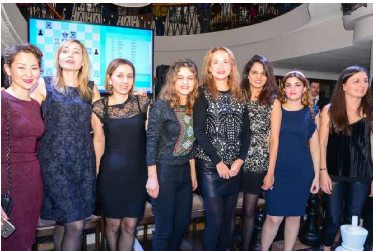
The women's team bounced back to tie the match at 1½-1½.