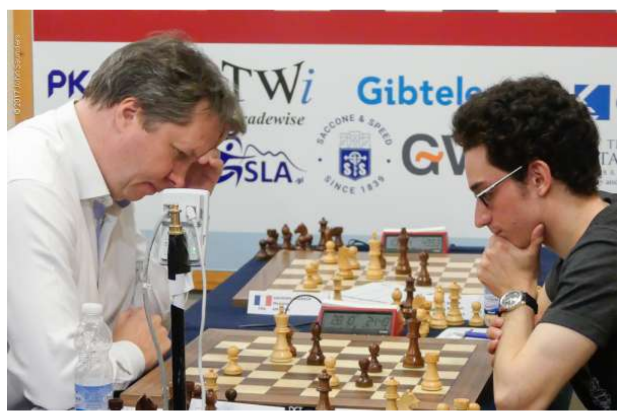
Nigel Short close to victory against Fabiano Caruana