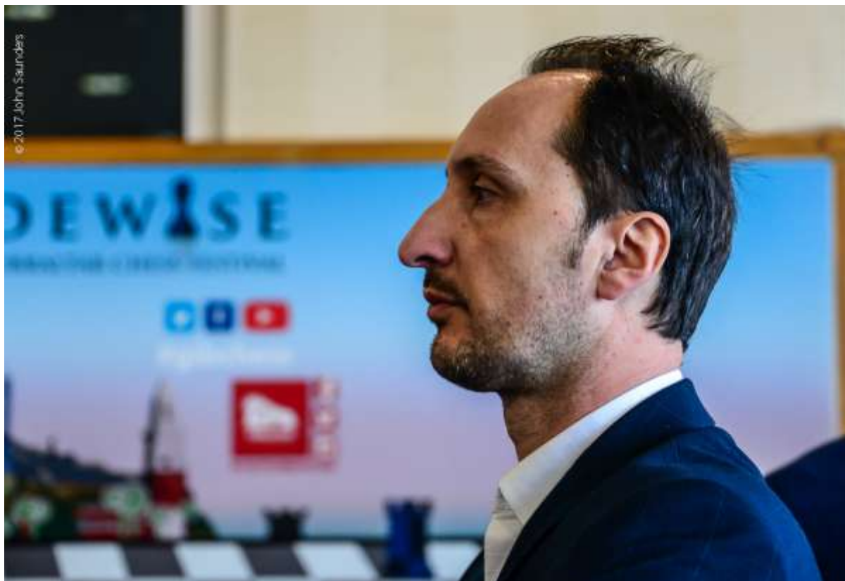
A pensive Veselin Topalov before the ninth round, in which he played well below par.

The writing was on the wall for the top board game between Maxime Vachier-Lagrave and Yu Yangyi when Black defended with a Petroff, which preceded the Berlin as the favourite method for Black to dig in for a draw when faced with 1.e4. It was all too effective here and not much happened on this board. Nakamura-Caruana showed the same super-GM approach to defending 1.d4, with Caruana going in for the Queen's Gambit Accepted and an unusually cagey Nakamura allowing an early queen exchange.